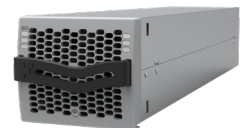
Flexa 25 - 230/230