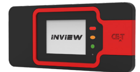
Inview S - Monitoring